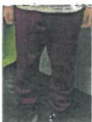
4. Track suit pants burgundy