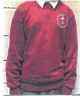
1. Windcheater burgundy with white logo