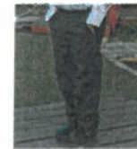
4. Pants—dark grey