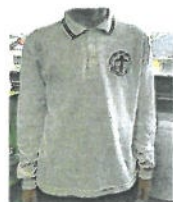
3. Long sleeve striped polo top white with burgundy logo

Sport —White sports socks with lace up runners