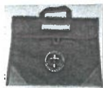
10. Library Bag