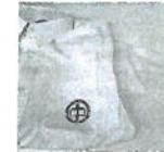
3. Shirt long sleeved button up with collar white with burgundy logo