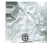
5. Shirt short sleeved button up with collar white with burgundy logo