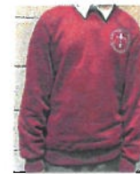
1. Windcheater burgundy with white logo