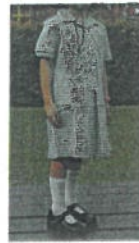
2. Dress Summer green