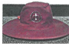
7. Hat burgundy with white logo