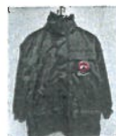
9. Rain Jacket black with logo