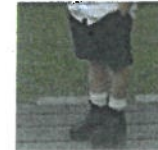
2. Shorts—dark grey