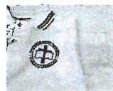
5. Short sleeve striped polo top white with burgundy logo