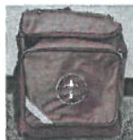
8. School Bag burgundy with white logo